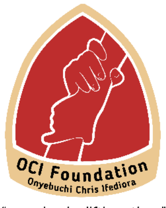
"...we rise, by lifting others"