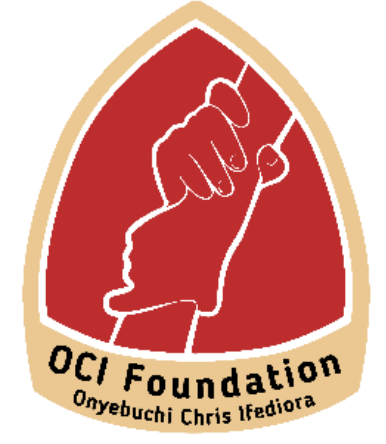
"...we rise, by lifting others"

References from: <u>https://bmcpublichealth.biomedcentral.com/articles/10.1186/s12889-019-6890-2</u>