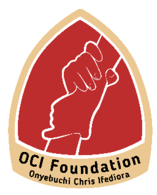
"...we rise, by lifting others"