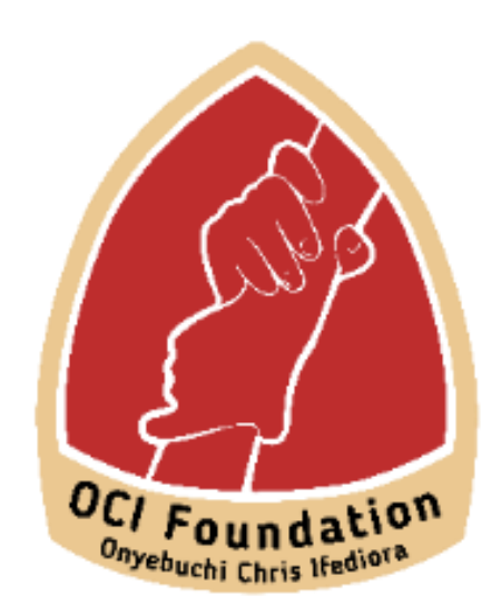
"...we rise, by lifting others"