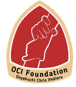
"...we rise, by lifting others"